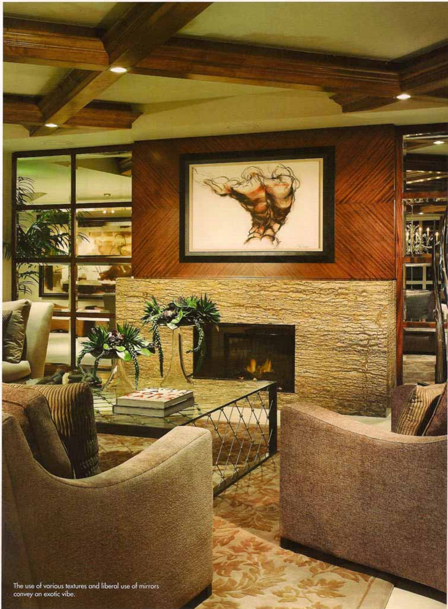
The use of various textures and liberal use of mirrors convey an exotic vibe.